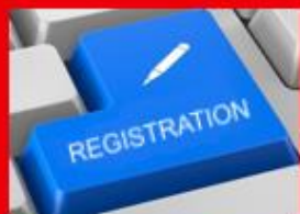
Registration to LLL Programme

WELCOME TO THE LLL PROGRAMME IN CLINICAL NUTRITION AND METABOLISM