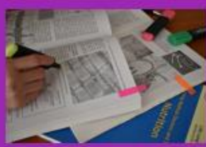
LLL Courses at ESPEN Congress