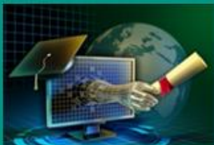
ESPEN Diploma and Application to Final Exam