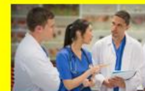
Course in Clinical Nutrition for Medical Students PRE-G LLL