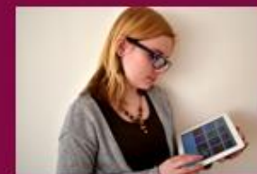
Learning Instructions, Rules, Procedures, Credits