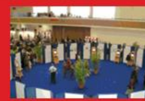
Application for TLLL Courses